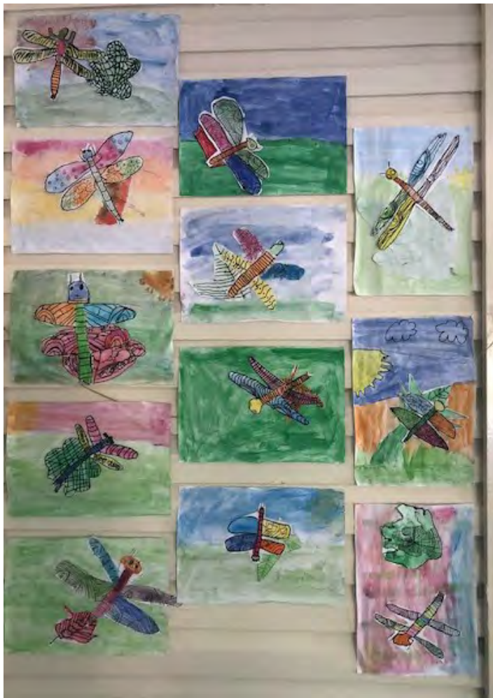
Artworks by 1/2B