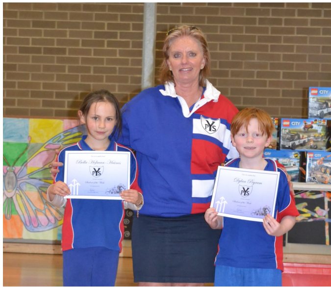
Principal Awards - Week 10 ,Term 3