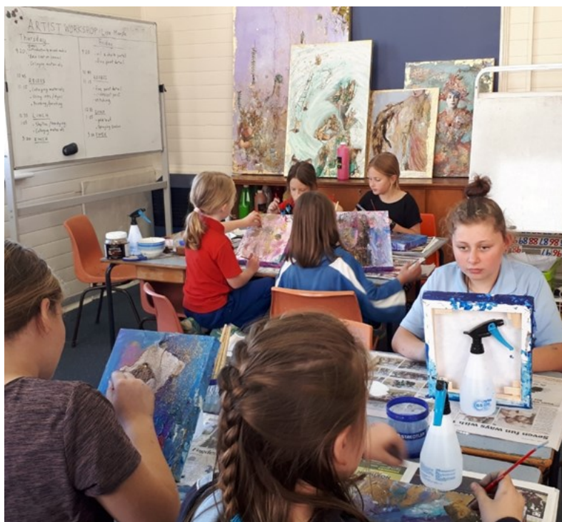
Students creating mixed-media artworks at Yass Public's art workshop.