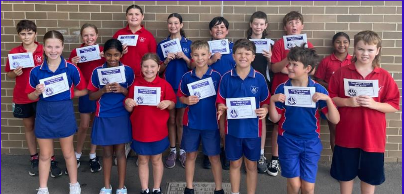
5/6L Bronze Awards